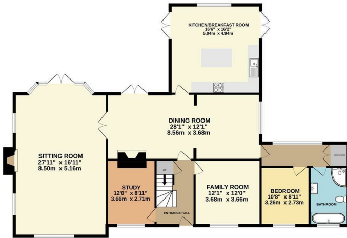
GROUND FLOOR 1626 sq.ft. (151.1 sq.m.) approx.